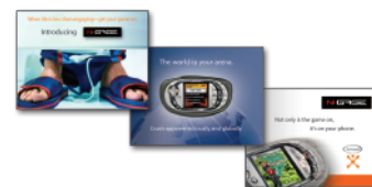
CINGULAR 1:20 SPOT