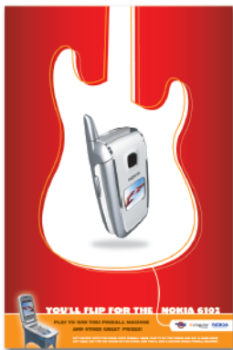
NOKIA HARD ROCK LIVE PROMOTIONAL POSTER

I am a freelance creative (art) in Dallas. I work with hundreds of clients and agencies each year to create award-winning advertising, direct mail, promotion, broadcast and web/multimedia campaigns. Pairing over a decade of experience with strategic thinking, I'm an expert at creating actionable initiatives that move customers to purchase. My work has helped launch products for Anheuser-Busch, Rent-A-Center's national broadcast/print campaign and direct-mail programs for Cingular Wireless. My past and present clients include Pizza Hut, Hilton, Nokia, Southwest Airlines, T.G.I. Fridays, Frost Bank, Shell Energy, TXU, Fisher-Price, ABC Radio and Procter & Gamble to name a few. I hope we can work together soon. 😊