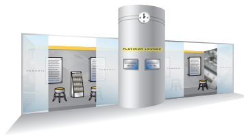
PENZOIL SEMA SHOW LOUNGE